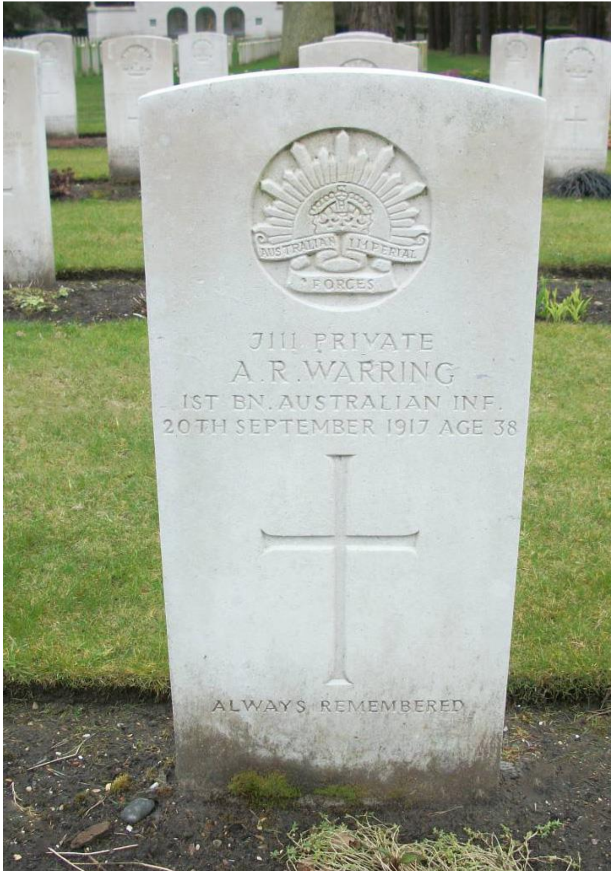
Photo of Private A. R. Warring's Commonwealth War Graves Commission Headstone in Brookwood Military Cemetery, Surrey, England.